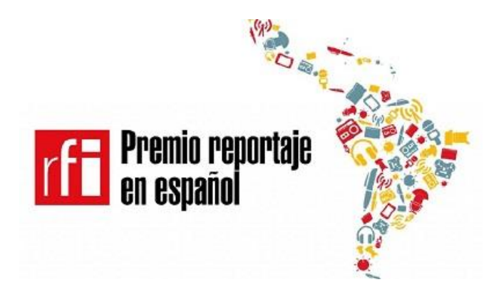
Figure 8. Logo of the Spanish Reportage Award given by RFI

RFI International's commitment to quality journalism, the synergy between French and Spanish-American talent is evident in the delivery of the "RFI Spanish Reportage" award (Illustration 8), which in 2019 held its fifth edition. An award for journalism students under the age of 30, residing in Latin America and the Caribbean. To participate, students must send a radio report of a maximum duration of 13 minutes, as well as a proposal for a report to be carried out in Paris, which can finally be carried out during the four months of fully paid stay obtained by the winner of the contest.