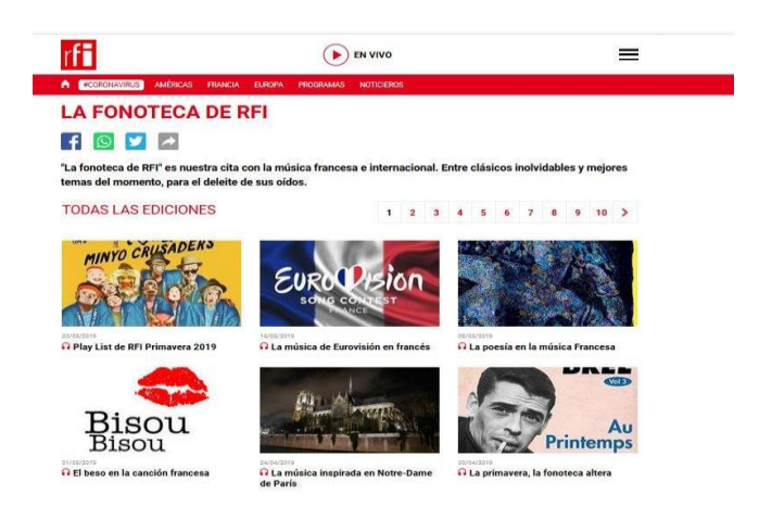
Figure 7. Musical spaces of the program "La fonoteca de RFI"

music, contrasting with the information that makes up a large part of the station's programming.