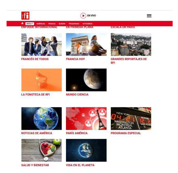
Figure 6. Repository of RFI programs in Spanish

Table 1. Description of the contents of the programs in Spanish