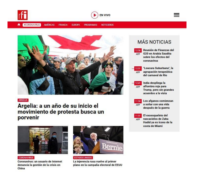
Figure 1. RFI web portal in Spanish

Radio France International started, in 1998, its specific website for content in Spanish. The link is a derivation of the official website, hence the relevance of the presence in Spanish for Radio France. <u>http://www.rfi.fr/es/</u>