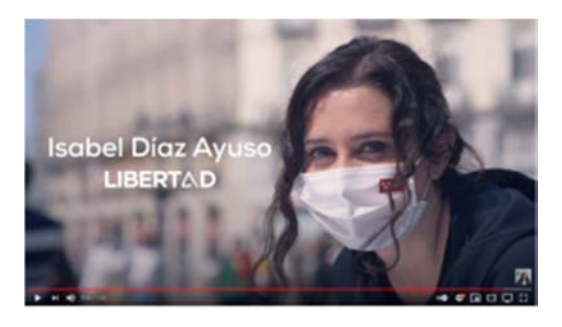
Figure 11. Ayuso breaks the fourth wall with the title of the spot superimposed

In the graphics section, the video of the Partido Popular shows the title Libertad , in capital letters, at the end of the footage under the name of the candidate. The used font combines a standard, academic typeface with the more informal and modern letter "A" that appears to be handwritten. At the same time, that letter "A" forms an equilateral triangle supported on its base, conveying stability.