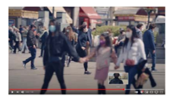
Figure 10. Shot with little depth of field