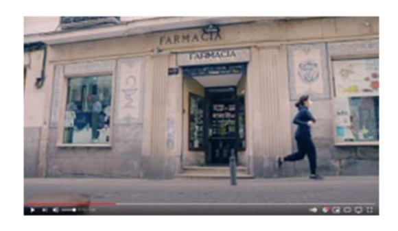
Figure 3. Ayuso moves to the right