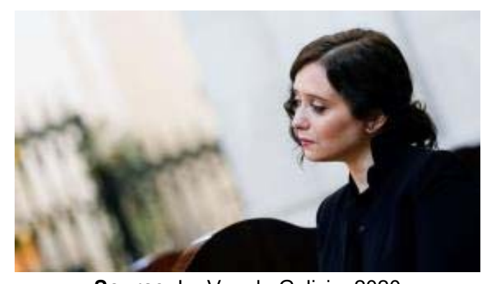
Figure 1. Ayuso cries at mass for the victims of Covid-19

The severity of the Covid-19 pandemic caught the world's rulers and institutions off guard. In general, all the governments were overcome by the situation, including that of the Community of Madrid, which came to have the highest incidence figures in Spain and the European Union, suffice it to remember a desolate Ayuso crying at mass for the deceased, with makeup mixed with tears running down her face, or the controversial photographs in which the candidate posed for the cover of the newspaper El Mundo, imitating a Virgin of Sorrows. "The media also question the reliability and emotional stability of women politicians. You already know that the stereotype says that women are emotional creatures" (García, 2017). The communication team and some newspaper heads took the opportunity to present the president as a person of great empathy, the victim of an unfortunate situation in which nothing could be done.